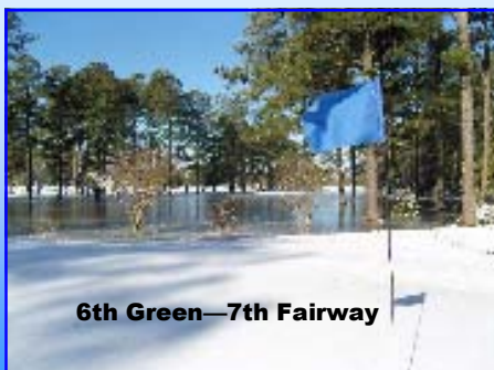
6th Green—7th Fairway