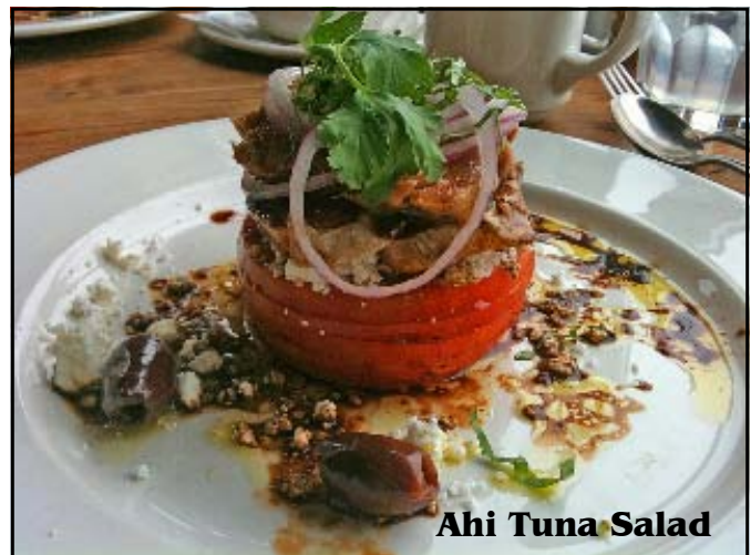
Ahi Tuna Salad