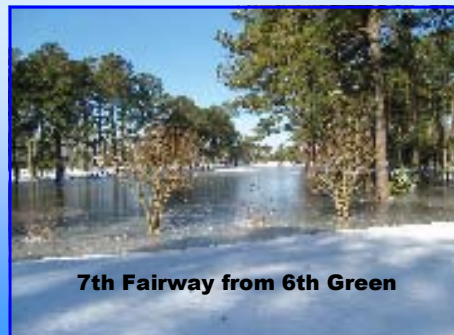
7th Fairway from 6th Green