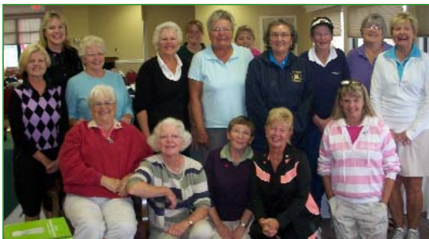
2011 LGA Members-All Winners!!!